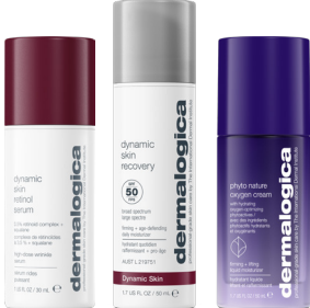
Dynamic Skin Retinol Serum Dynamic Skin Recovery SPF 50 Phyto Nature Oxygen Cream