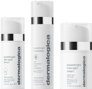
PowerBright Dark Spot Serum PowerBright Moisturizer SPF 50 PowerBright Overnight Cream