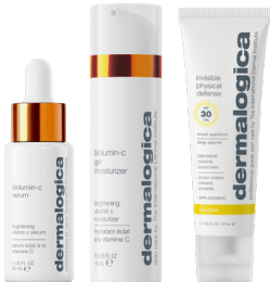
BioLumin-C Serum BioLumin-C Gel Moisturizer Invisible Physical Defense SPF 30